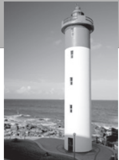
Umhlanga Rocks Lighthouse in Durban