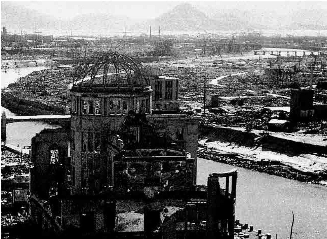
Hiroshima after the attack

The United States and the Soviet Union were looked upon as the superpowers who dominated Europe. However, they were both very different cultures with different ideals. The Soviet Union felt threatened 6 by the American presence in Europe and the United States feared that the Soviet Union wanted to control more of Eastern Europe than they did.