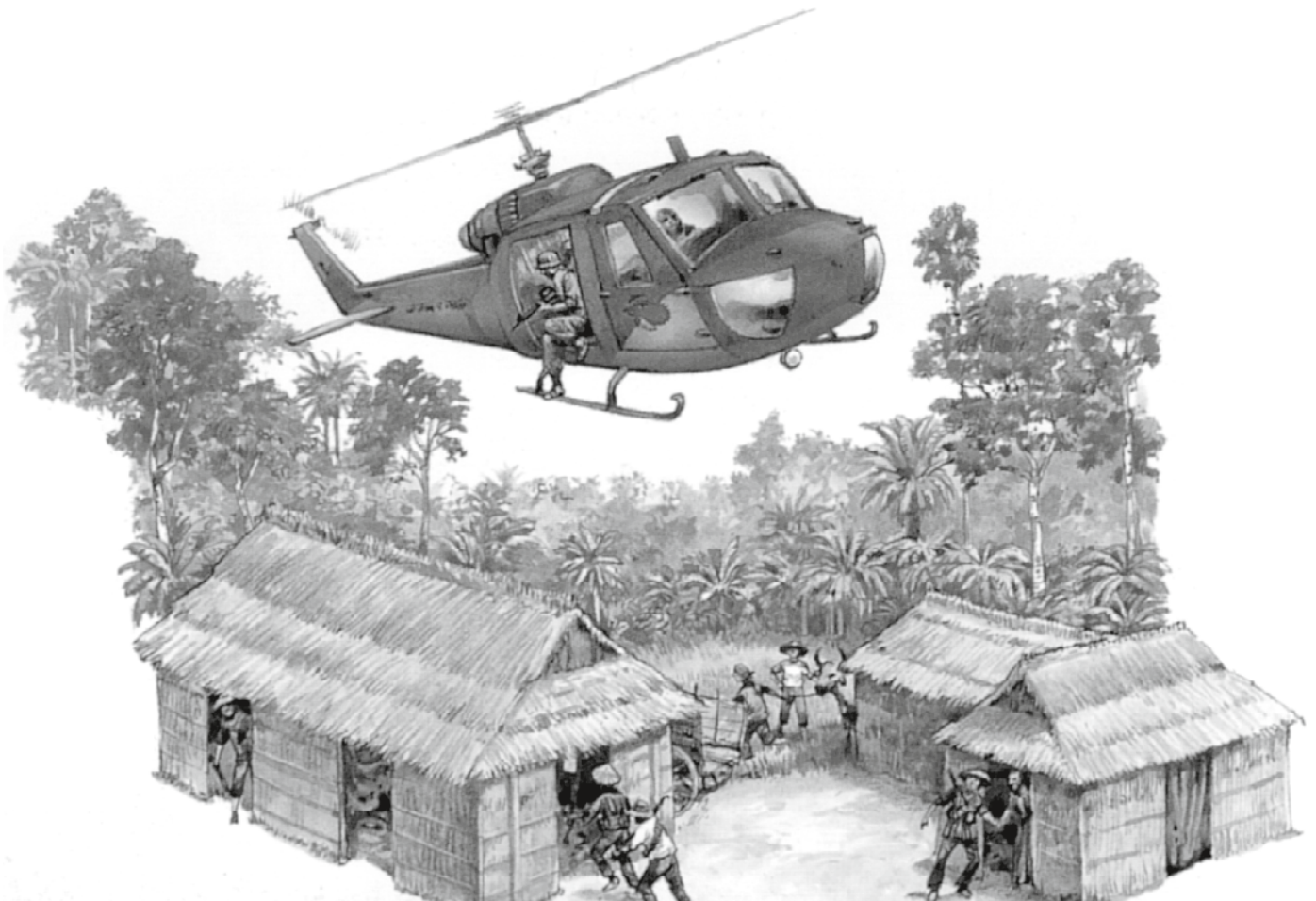
war in Vietnam