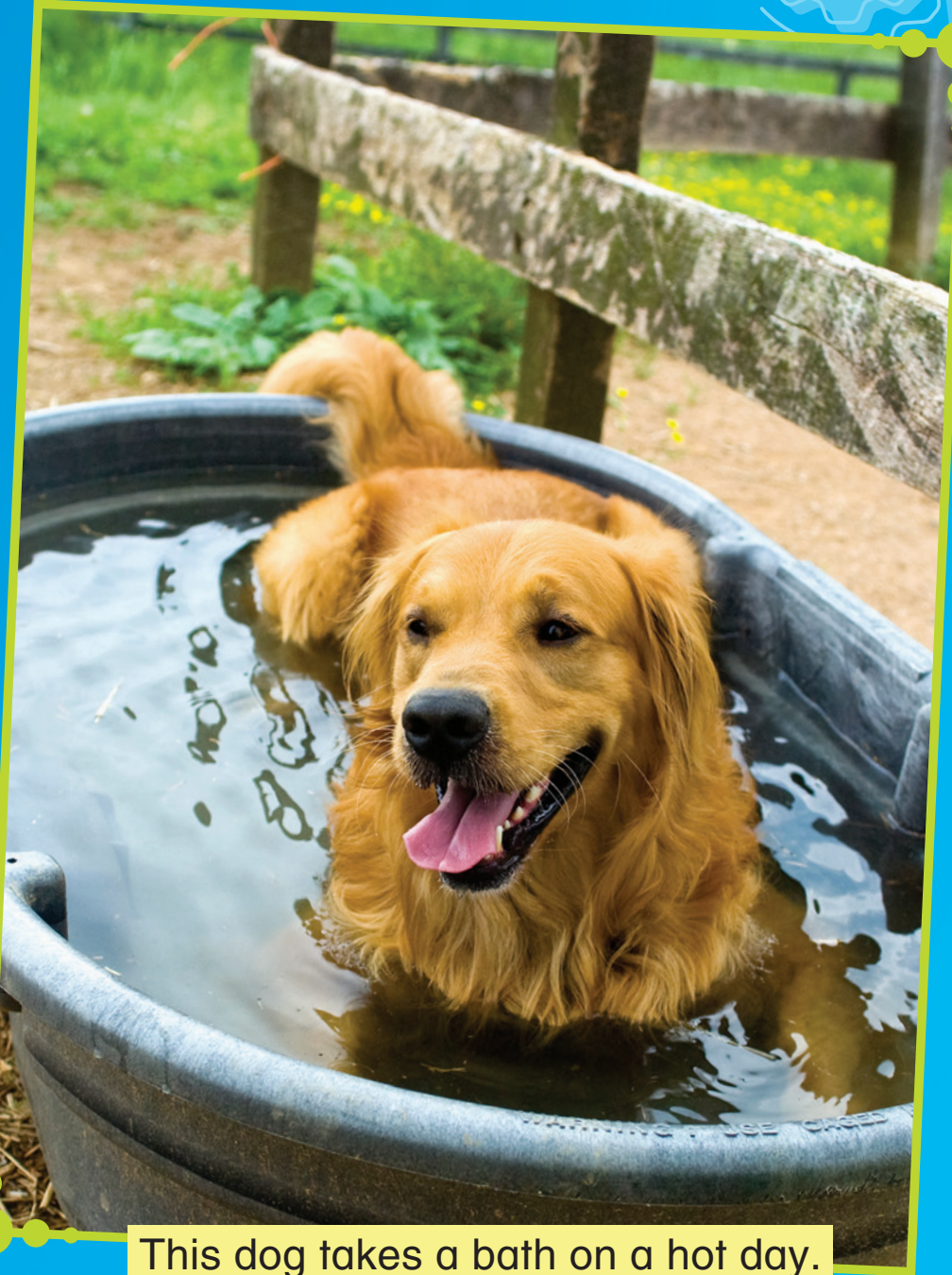
This dog takes a bath on a hot day.