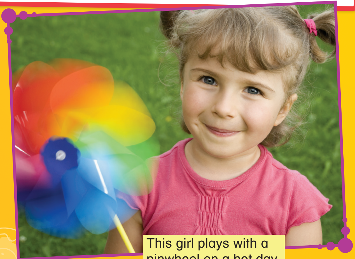
This girl plays with a pinwheel on a hot day.

What can people do to beat the heat? There are many good tricks for cooling off.