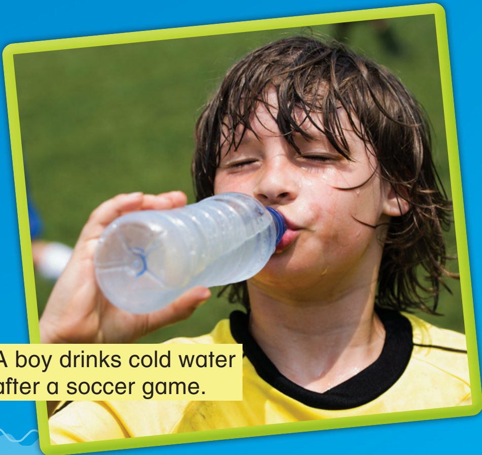
A boy drinks cold water after a soccer game.

The air is hot. Your clothes stick to your body. It is time to cool off!