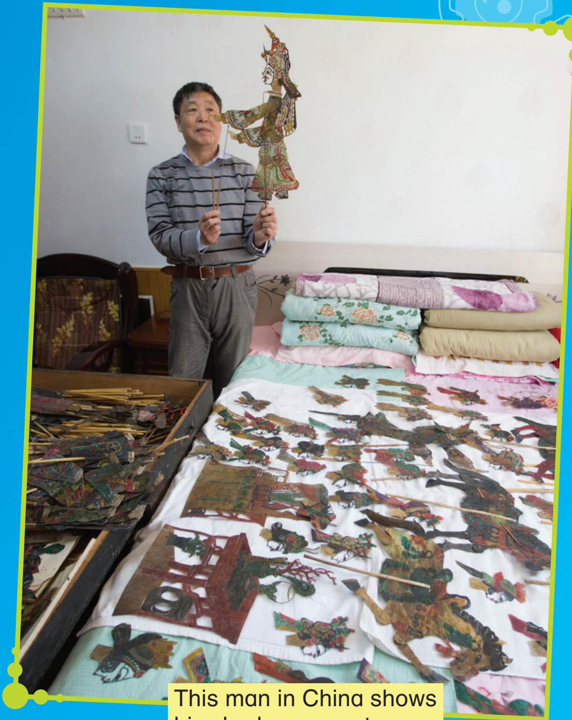
This man in China shows his shadow puppets.