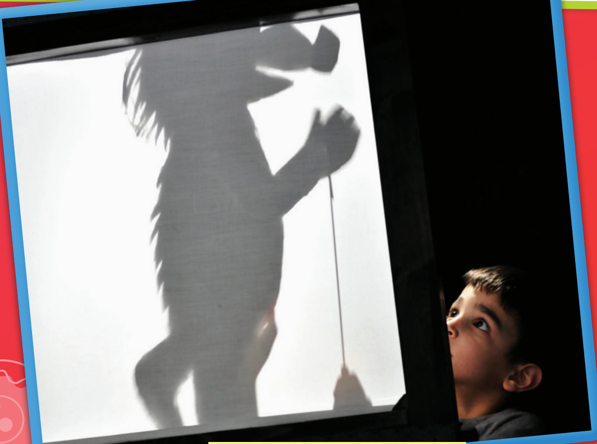
A boy makes a shadow puppet dance.

Shadow puppets are used to tell stories. They can move with music. They can dance too. They are fun.